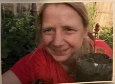
Acorns to plant

I first did a little pilot survey with members of a local nature reserve 'Friends of' group and some friends. After a very positive response to the idea I decided to go ahead. I already have over a hundred growers and around 2000 acorns distributed. But I still have a lot more if you have space and the inclination. All it takes are some pots, some earth and water to keep them damp. I've been storing the acorns in damp leaf mulch and they are sprouting nicely, they just need foster homes. They really are no trouble.